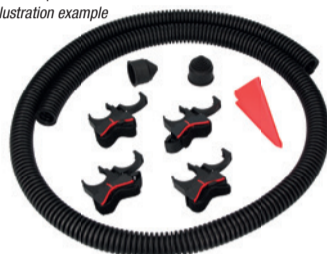
Abb. beispielhaft Illustration example