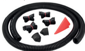
Abb. beispielhaft Illustration example