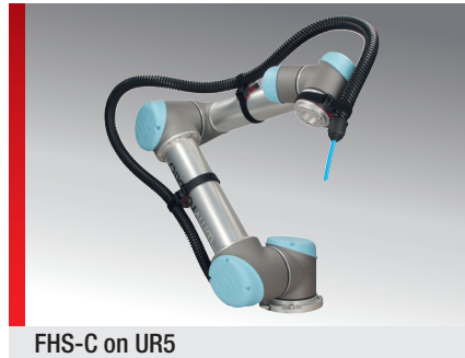
FHS-C on UR5